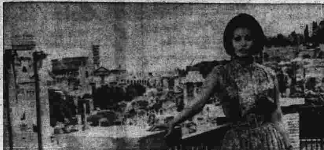
Italian actress Sophia Loren takes viewers on a tour of Rome's forum, above, and the Vatican during an hour-long view of the city on ABC's "Sophia Loren in Rome" Thursday at 10 p.m.