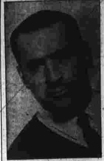
Speaks to IOH

The board of directors will be asked to approve a new Workable Program for the town of Manchester at their meeting Tuesday. The Workable Program is a comprehensive plan for keeping neighborhoods in good condition. It is required by the Federal government before funds are made available for renewal or housing projects.